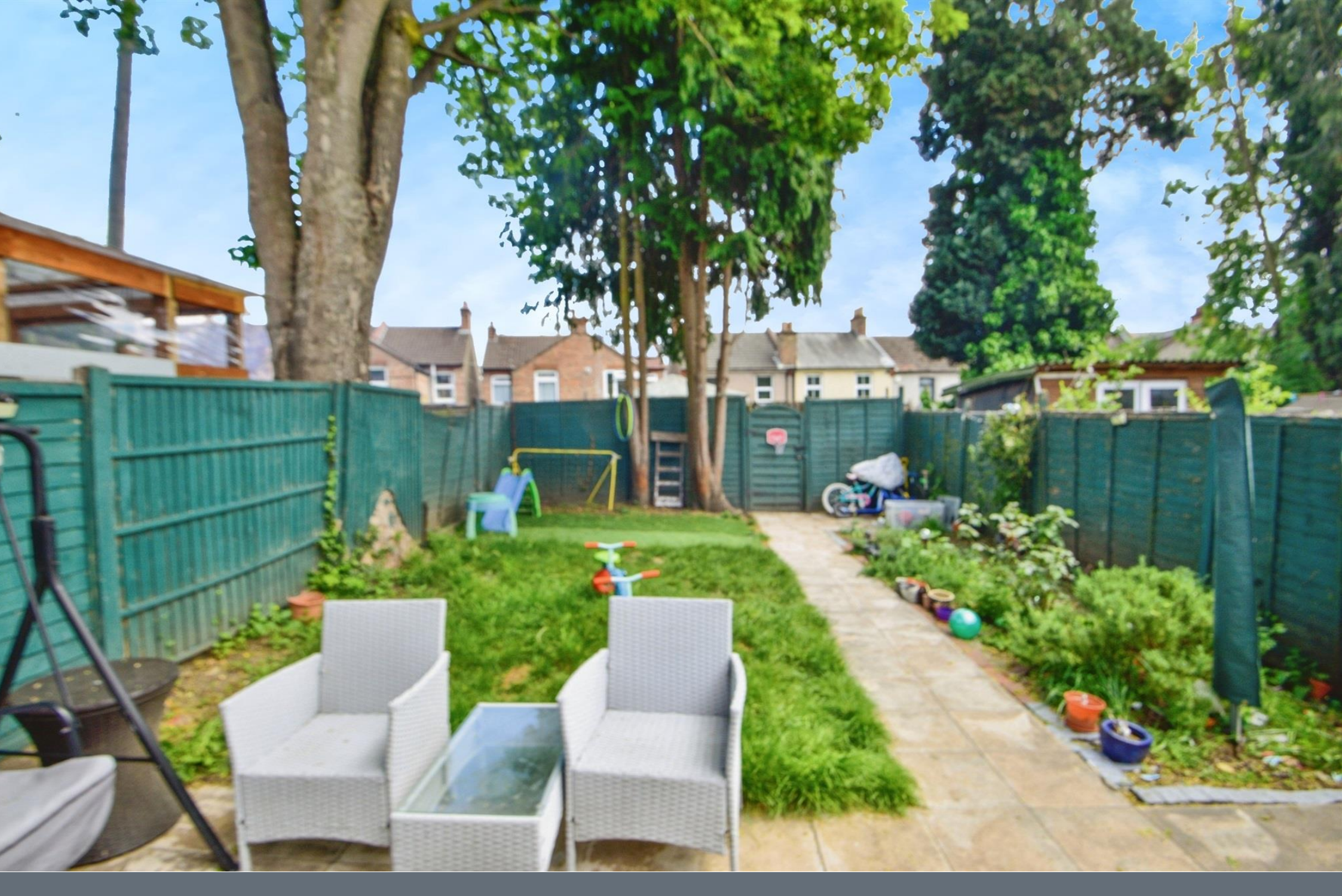
Residential Sales & Lettings | Mortgage Services | Conveyancing | Surveyors | Land & New Homes