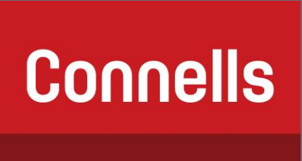
The Clarendon Clarendon Road Watford