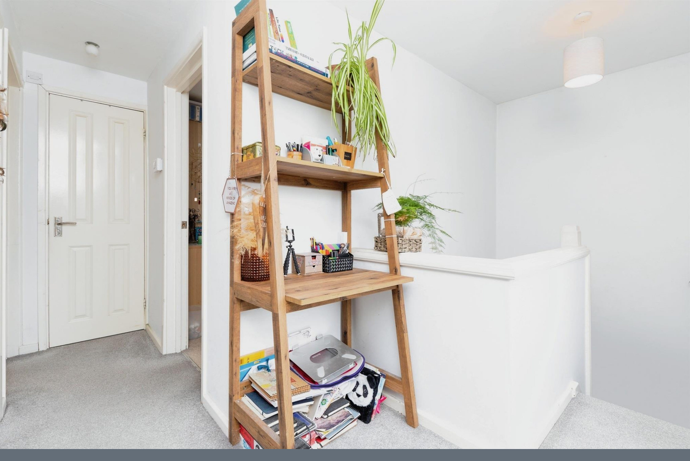
Residential Sales & Lettings | Mortgage Services | Conveyancing | Surveyors | Land & New Homes