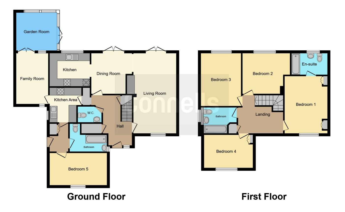
This floor plan is for illustrative purposes only. It is not drawn to scale. Any measurements, floor areas (including any total floor area), openings and orientation are approximate. No details are guaranteed, they cannot be relied upon for any purpose and they do not form part of any agreement. No liability is taken for any error, omission or misstatement. A party must rely upon its own inspection(s). Powered by www.focalagent.com

To view this property please contact Connells on