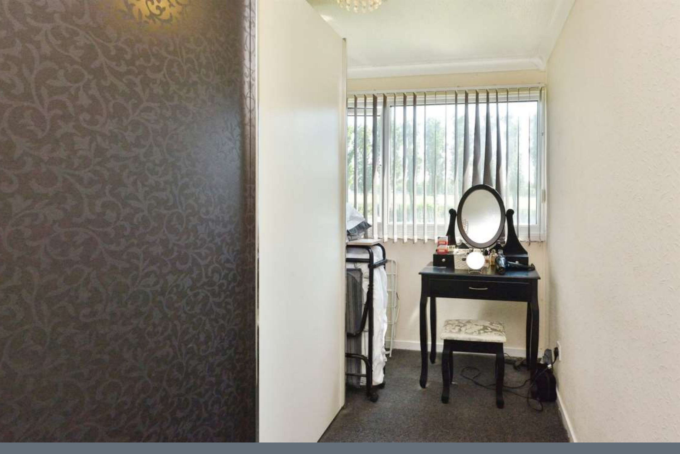
Residential Sales & Lettings | Mortgage Services | Conveyancing | Surveyors | Land & New Homes