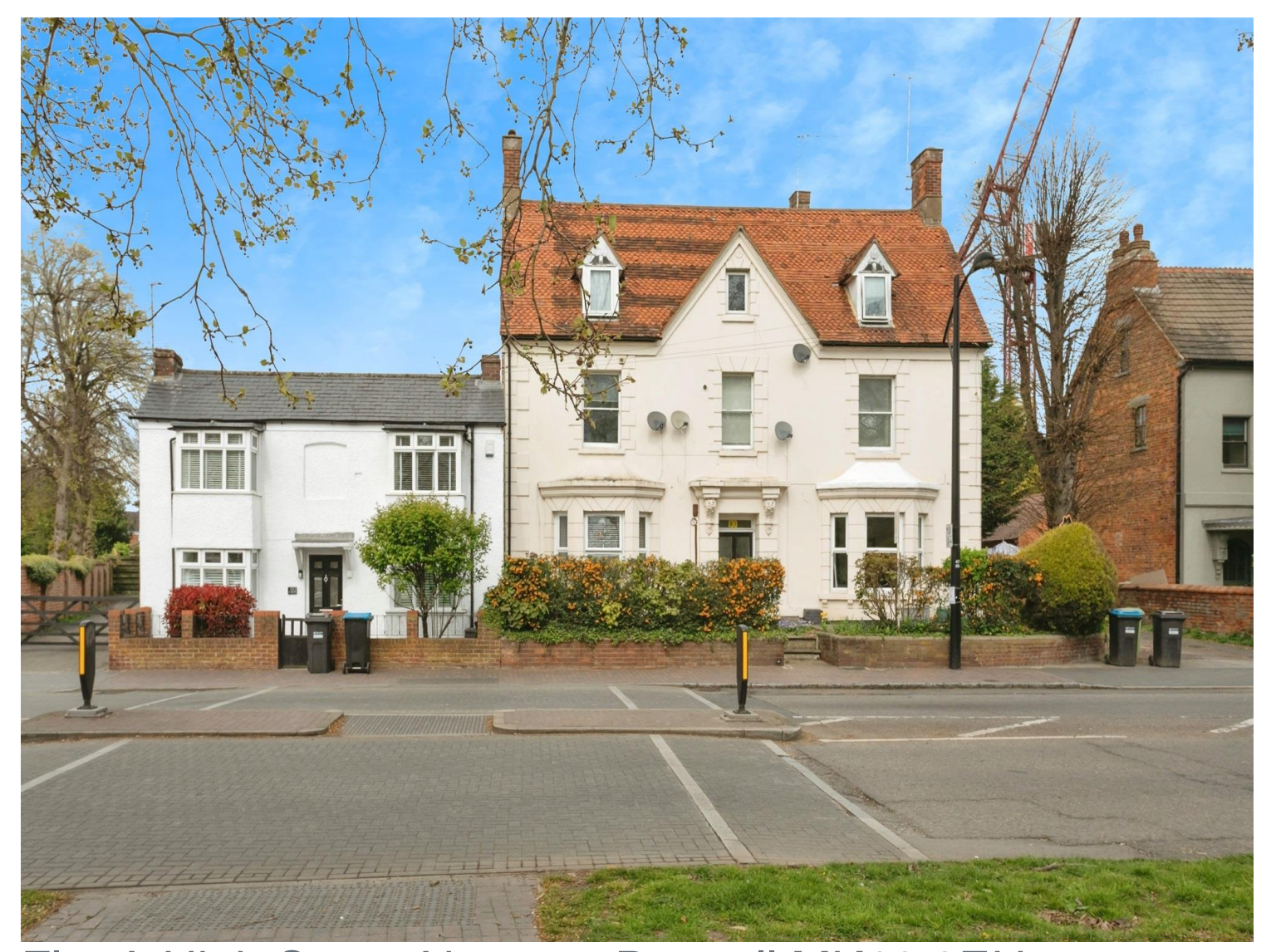
Flat A High Street Newport Pagnell MK16 8EH

Connells are pleased to bring to the market a two-bedroom ground floor apartment in the sought after area of Newport Pagnell.