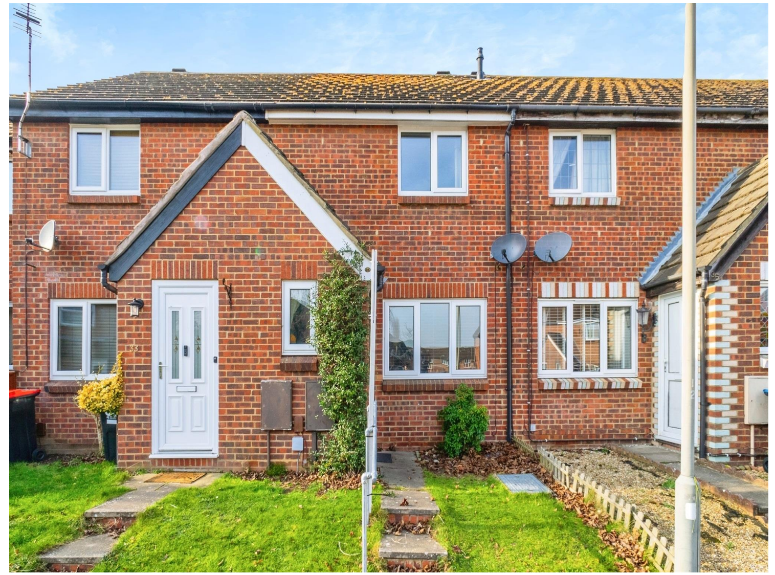
Greenwich Gardens Newport Pagnell MK16 0NP

Connells are pleased to bring to the market a two-bedroom mid-terraced home. With an enclosed rear garden and off-street parking. The property benefits from excellent school catchments, nearby to all amenities, good road links and public transport. A great opportunity for any buyer.