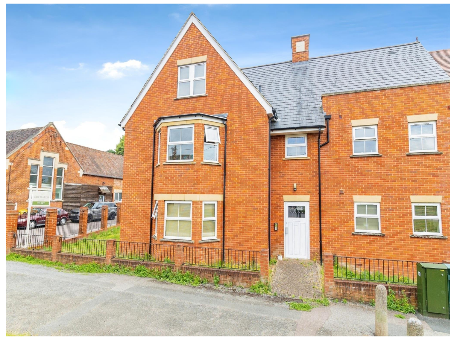
The Forge Vicarage Hill Flitwick Bedford MK45 1GZ

We are pleased to offer for sale this beautifully presented and well maintained top floor apartment located in an enviable position within Flitwick. Offering two double bedrooms, an en-suite and second bathroom, an open plan kitchen and living area.