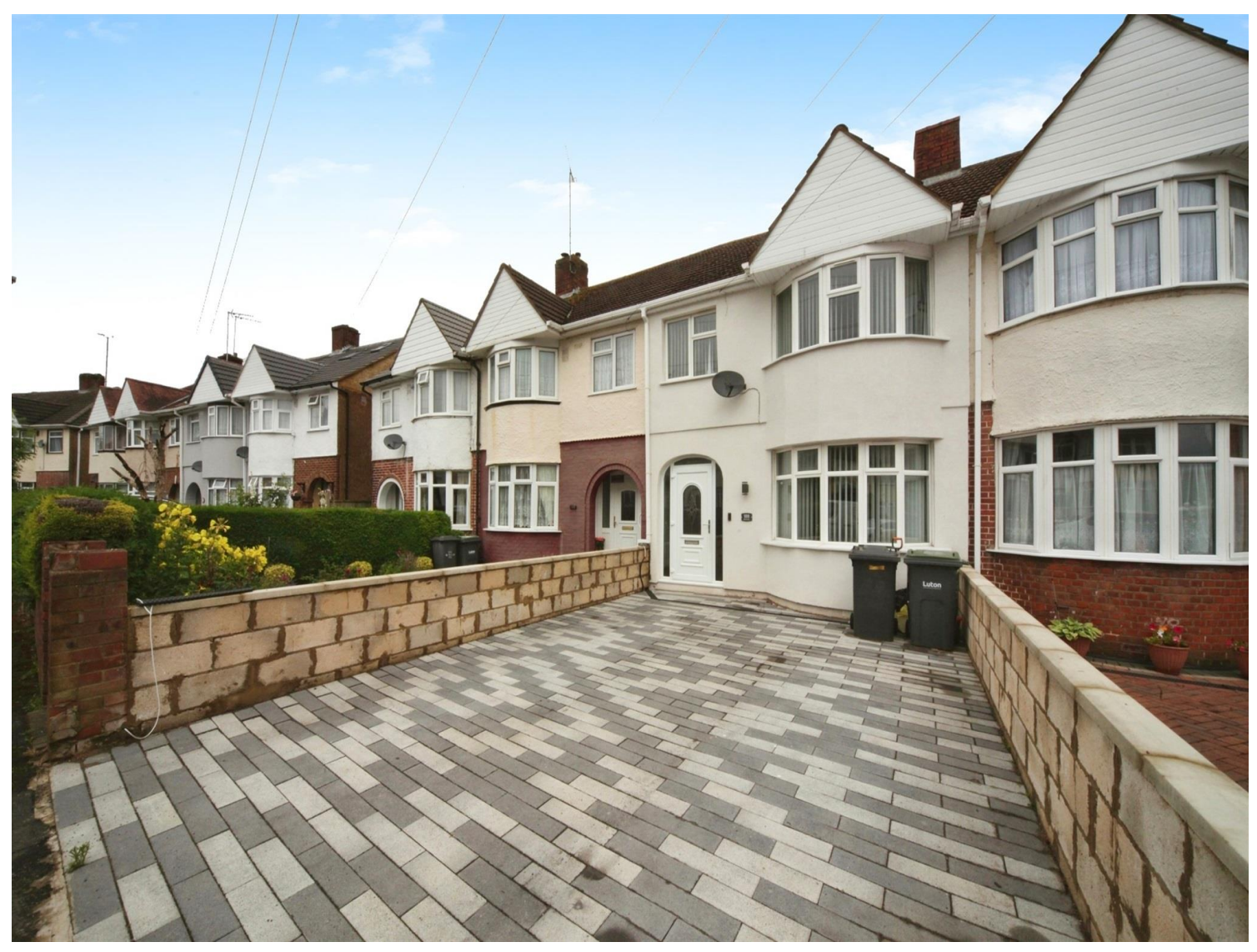
Willow Way Luton LU3 2SD