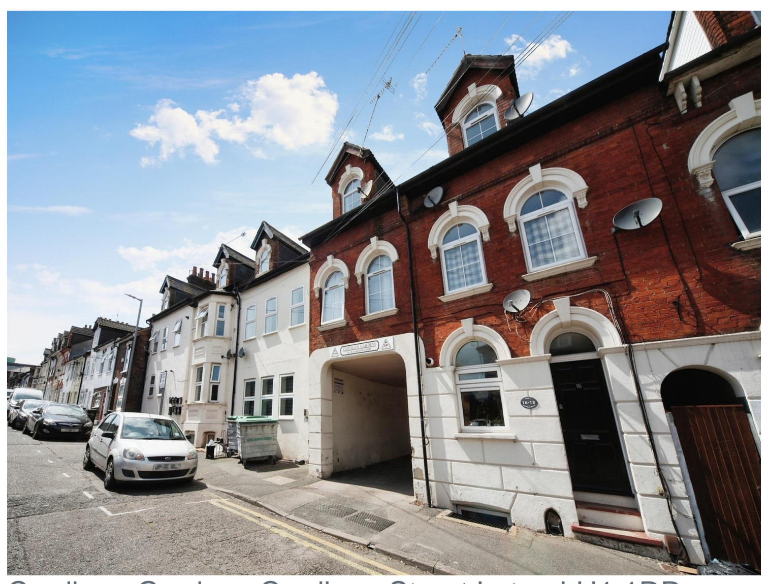
Cardigan Gardens Cardigan Street Luton LU1 1RR