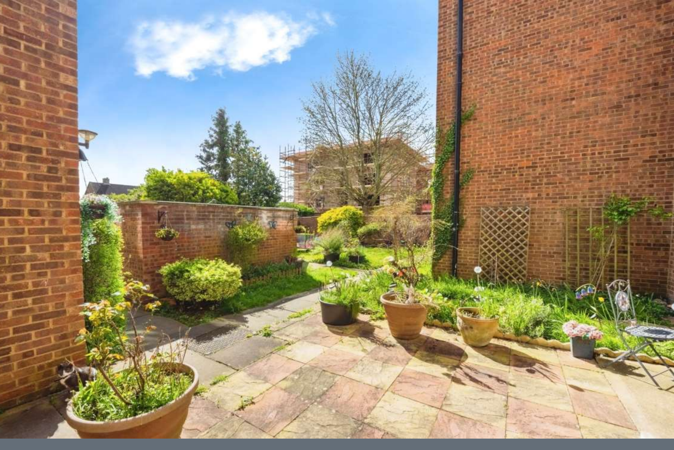
Residential Sales & Lettings | Mortgage Services | Conveyancing | Surveyors | Land & New Homes