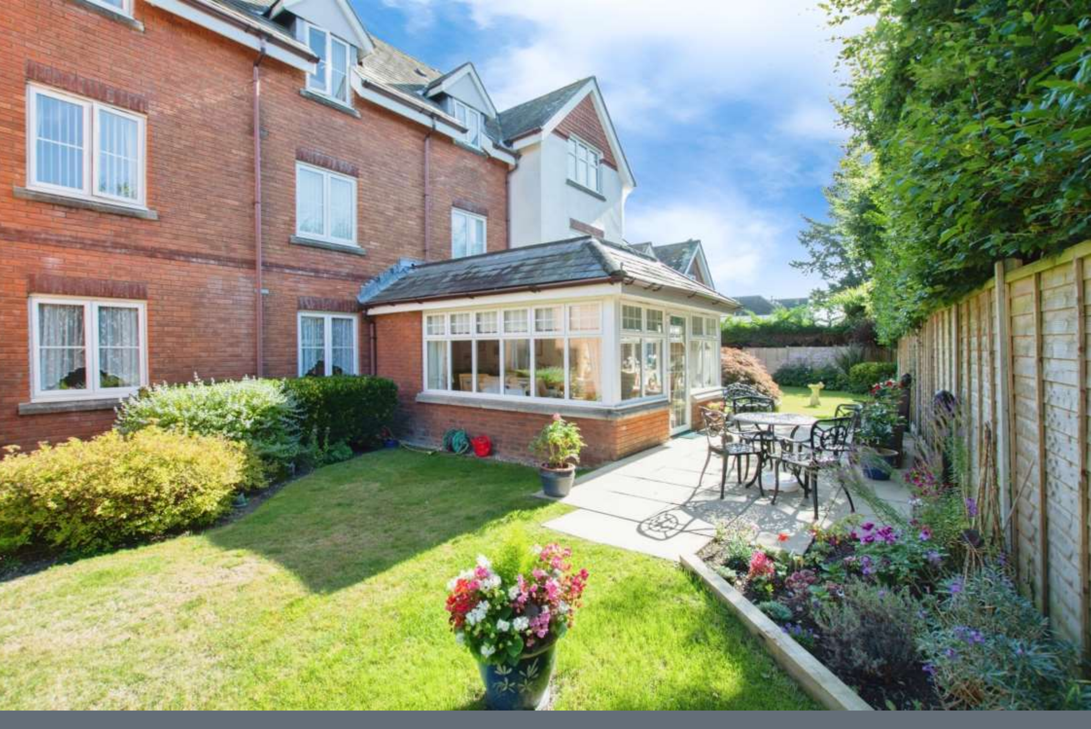
Residential Sales & Lettings | Mortgage Services | Conveyancing | Surveyors | Land & New Homes