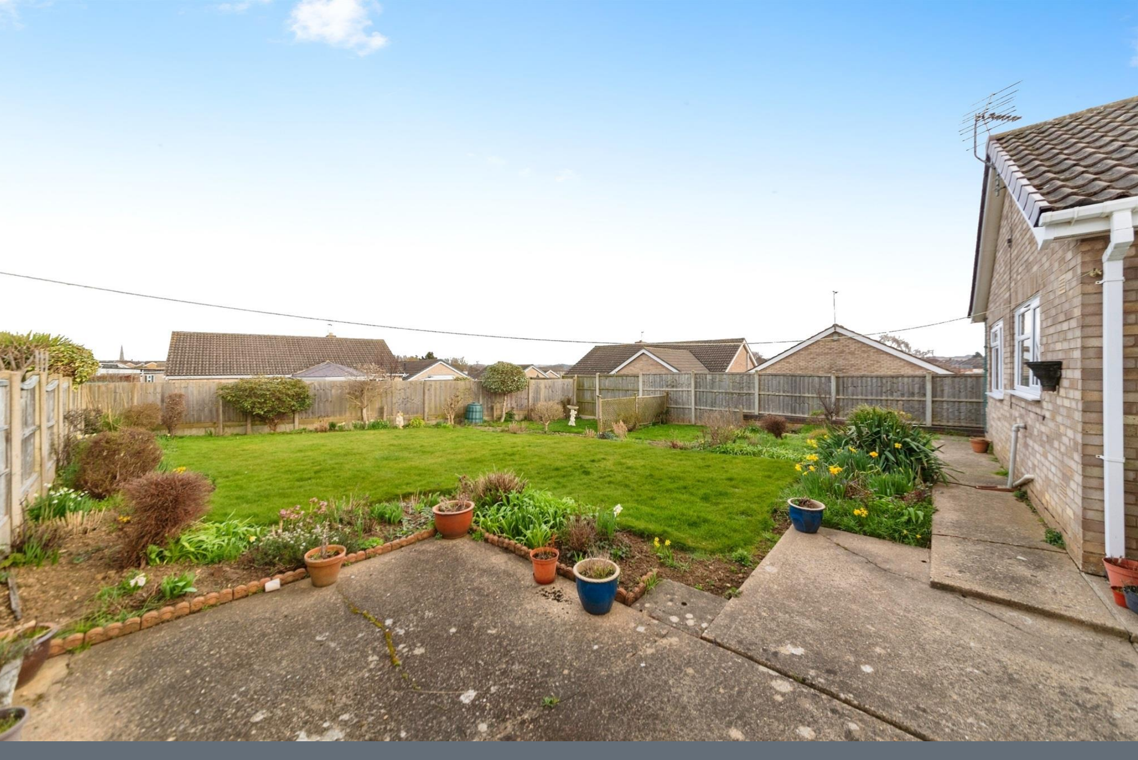
Residential Sales & Lettings | Mortgage Services | Conveyancing | Surveyors | Land & New Homes