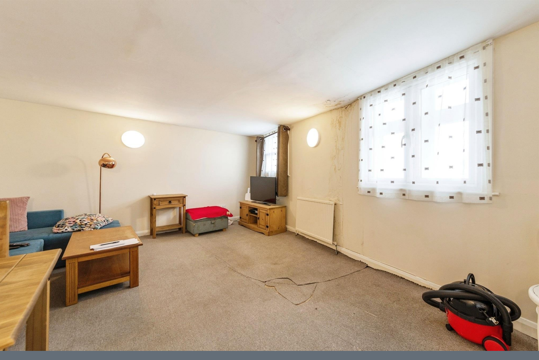
Residential Sales & Lettings | Mortgage Services | Conveyancing | Surveyors | Land & New Homes