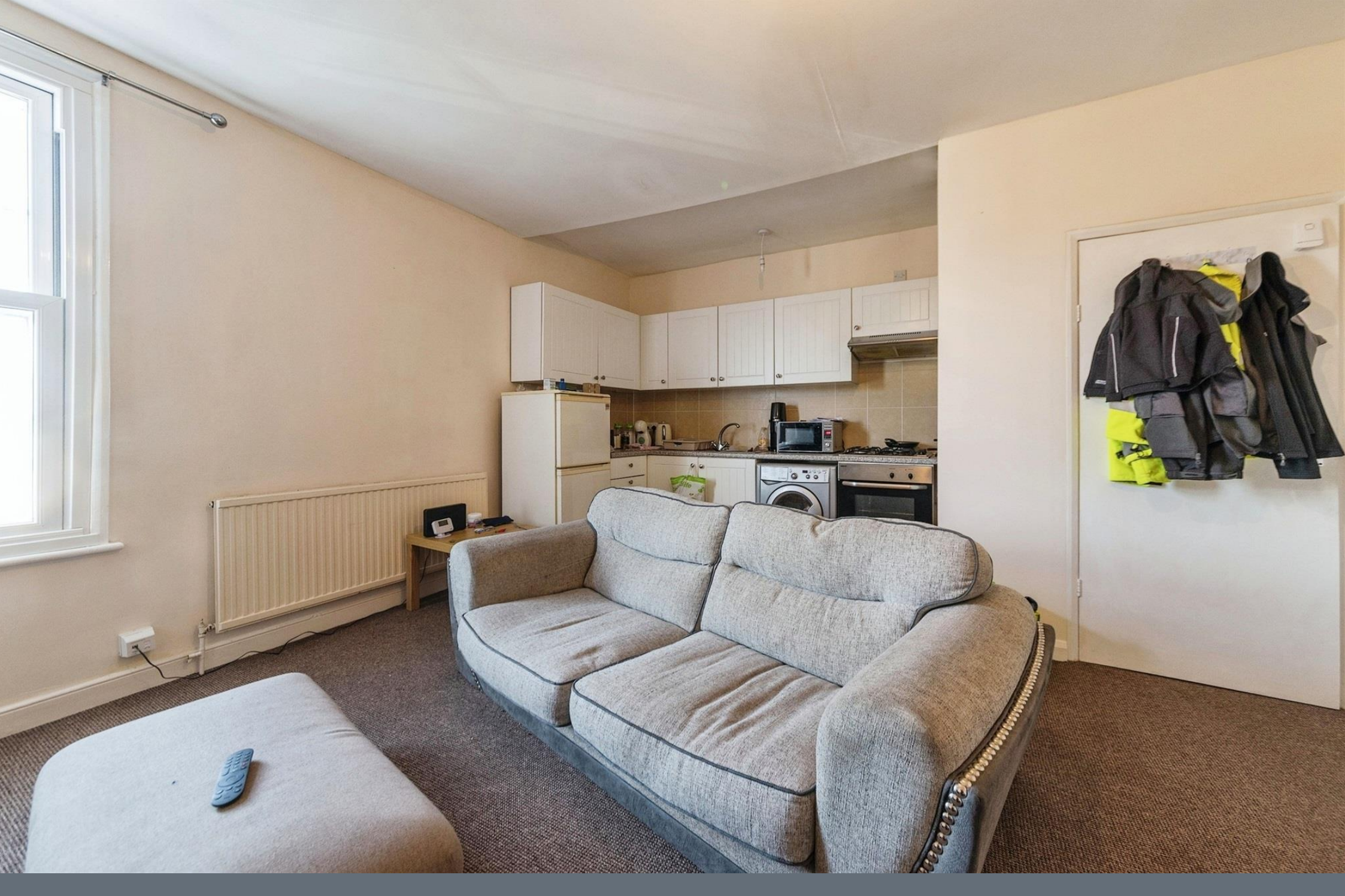
Residential Sales & Lettings | Mortgage Services | Conveyancing | Surveyors | Land & New Homes