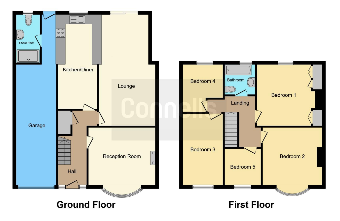
This floorplan is for illustrative purposes only and is not drawn to scale. Measurements, floor-areas, openings and orientations are approximate. They should not be relied upon for any purpose and do not form any part of an agreement. No liability is taken for any error or mis-statement. All parties must rely on their own inspections.

To view this property please contact Connells on