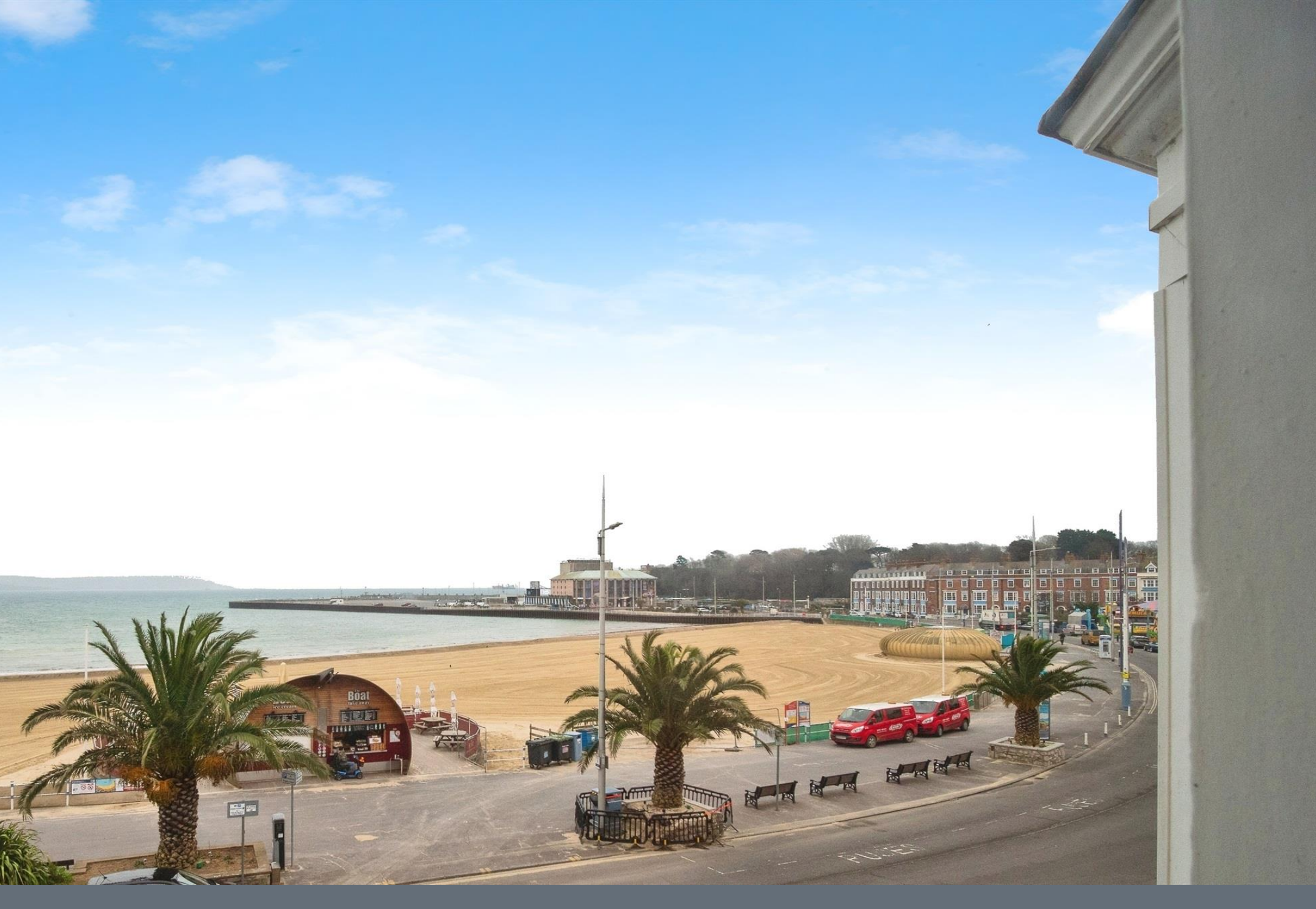
Residential Sales & Lettings | Mortgage Services | Conveyancing | Surveyors | Land & New Homes