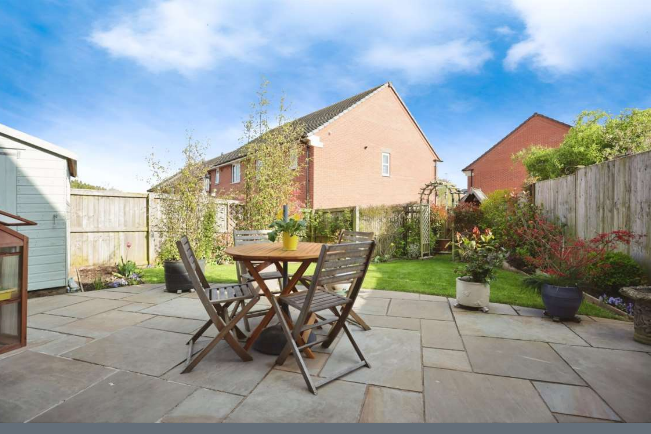
Residential Sales & Lettings | Mortgage Services | Conveyancing | Surveyors | Land & New Homes