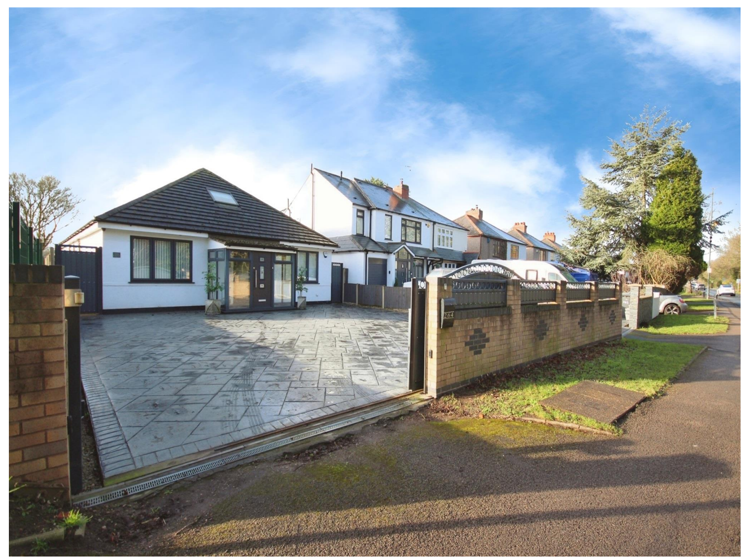
Rugby Road Binley Woods Coventry CV3 2BD

Offered with no upward chain, a viewing is a must to appreciate the accommodation on offer, Being detached and comprising of four bedrooms, large living/dining/kitchen area, snug living room and low maintenance gardens this house has to be viewed.