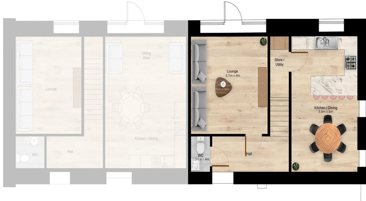
Proposed Layout Plan - Units 7 - GF. Scale 1:50

To view this property please contact Connells on