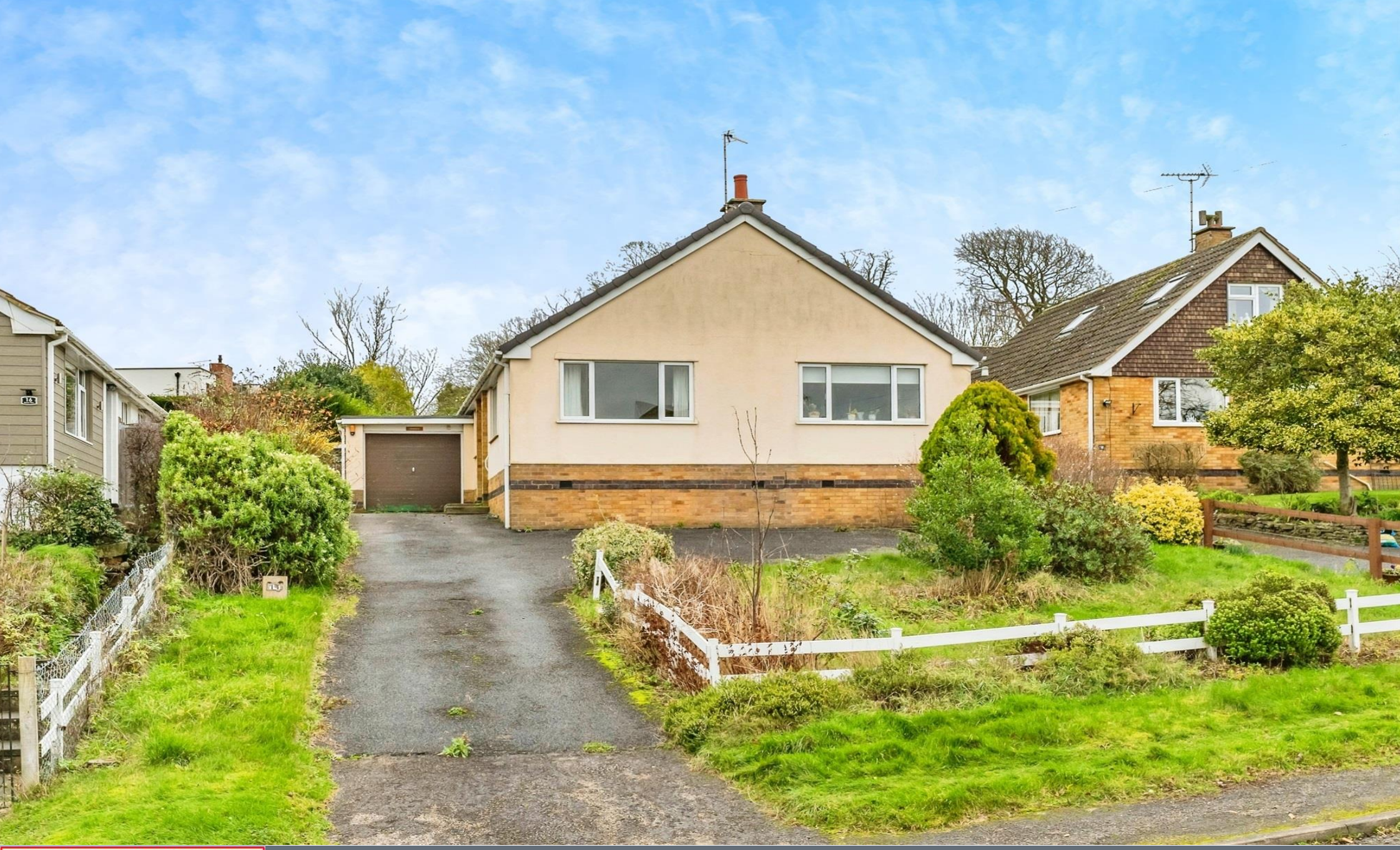
Not for marketing purposes INTERNAL USE ONLY