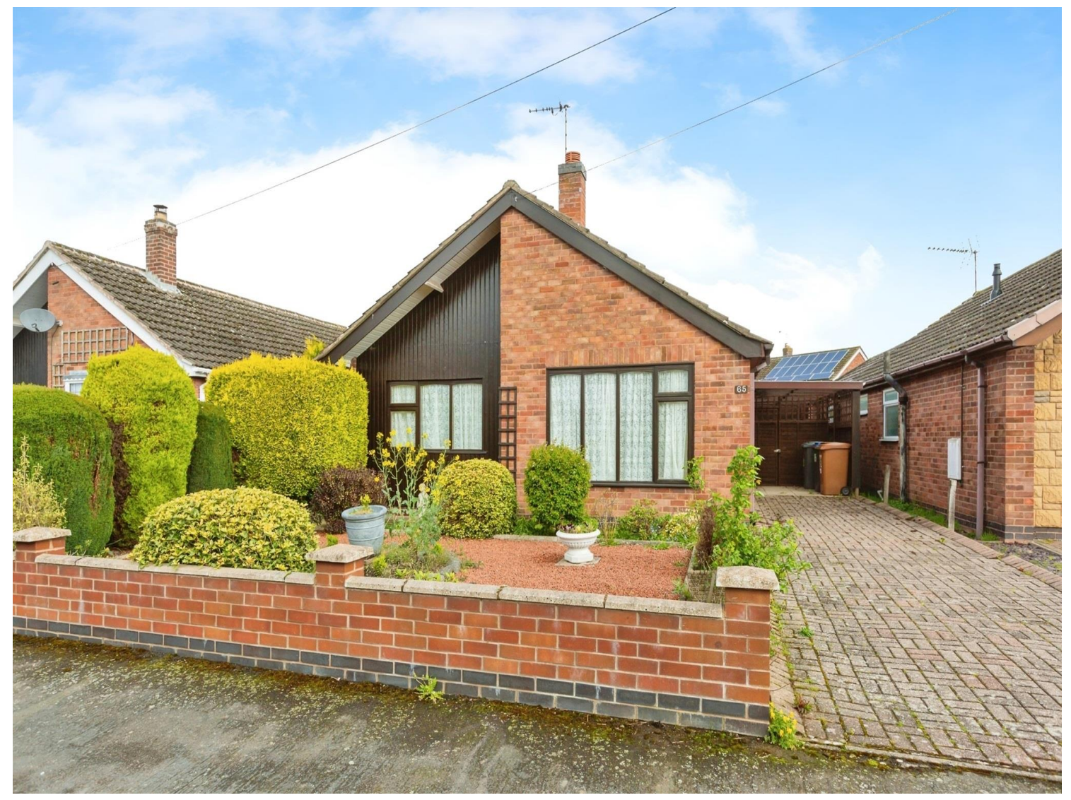
Peters Avenue Newbold Verdon Leicester LE9 9PR

Two double bedroom DETACHED bungalow situated in sought after cul-desac position within a popular village location benefitting double glazing. The accommodation briefly comprising porch, hallway, kitchen, lounge, conservatory, shower room, two bedrooms, driveway and gardens. NO UPWARD CHAIN.