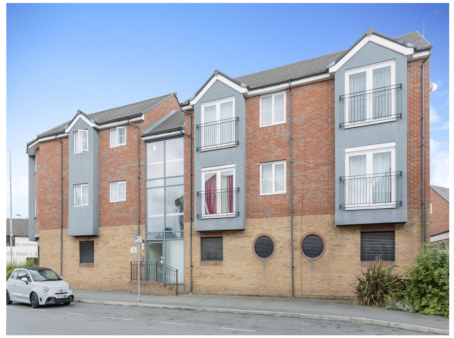
Almeys Lane Earl Shilton Leicester LE9 7AJ

Two-bedroom first floor apartment offered at 25% ownership. Benefiting a parking space and visitor parking space. Comprises entrance hallway, lounge, open plan kitchen, two bedrooms and bathroom.