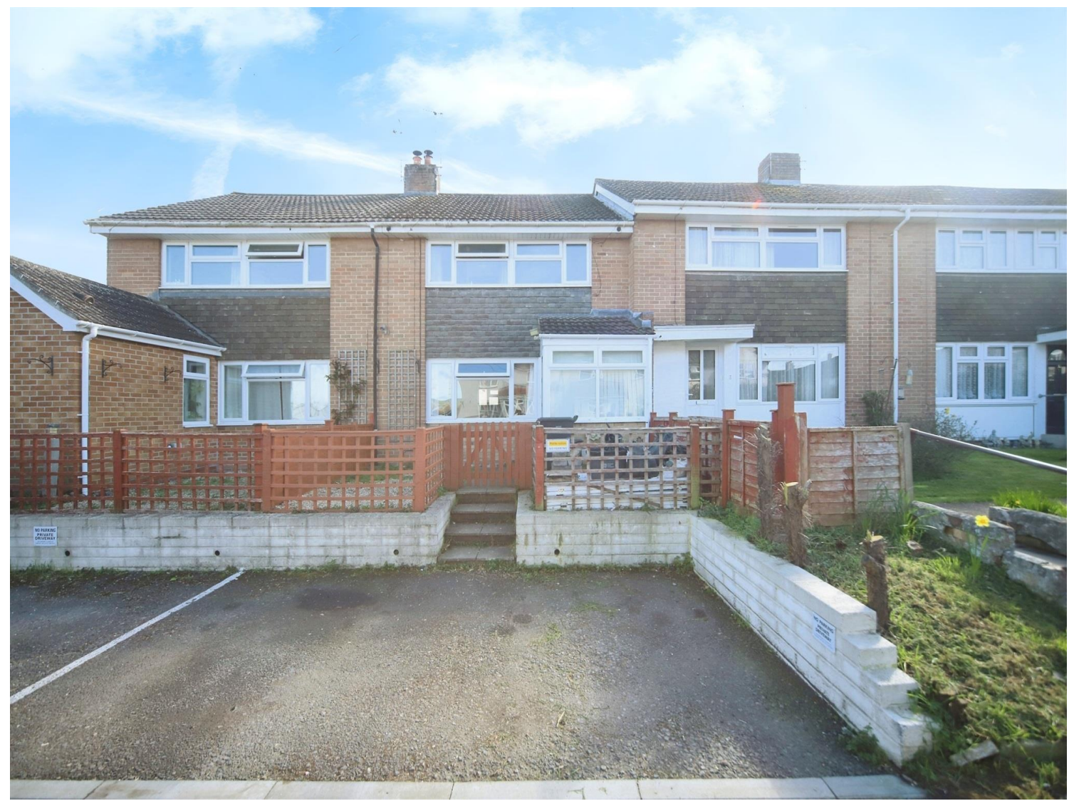
Farrant Close Bishops Hull Taunton TA1 5EL

Available with NO ONWARD CHAIN is this well proportioned three bedroom home with off road parking and a south facing, low maintenance rear garden.