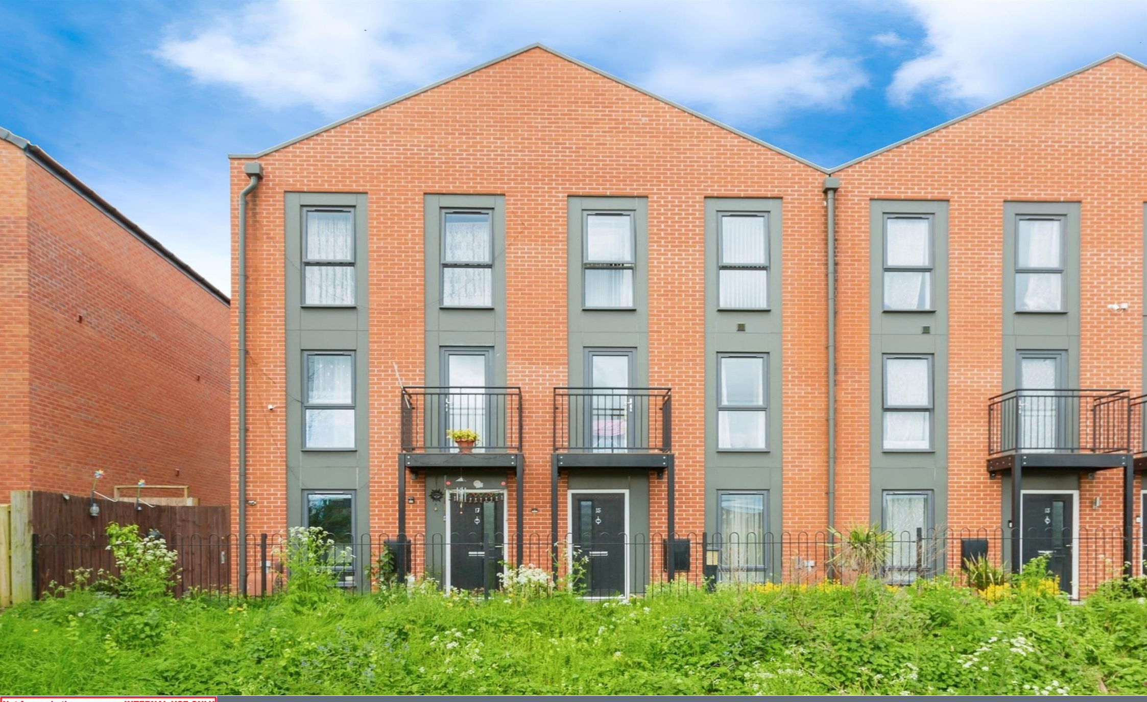
Not for marketing purposes INTERNAL USE ONLY