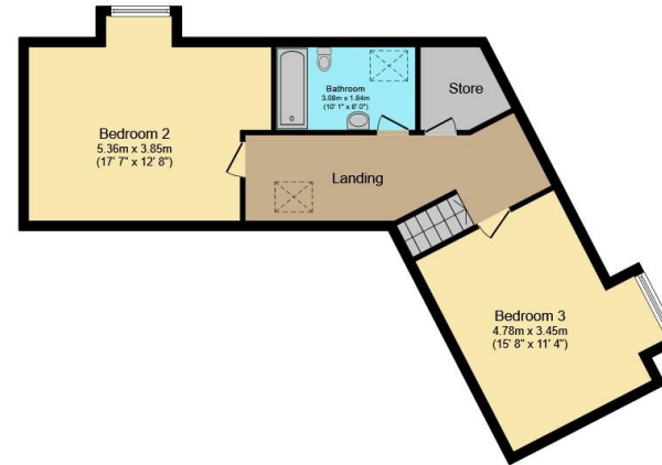
First Floor Floor area 61.0 m 2 (657 sq.ft.)