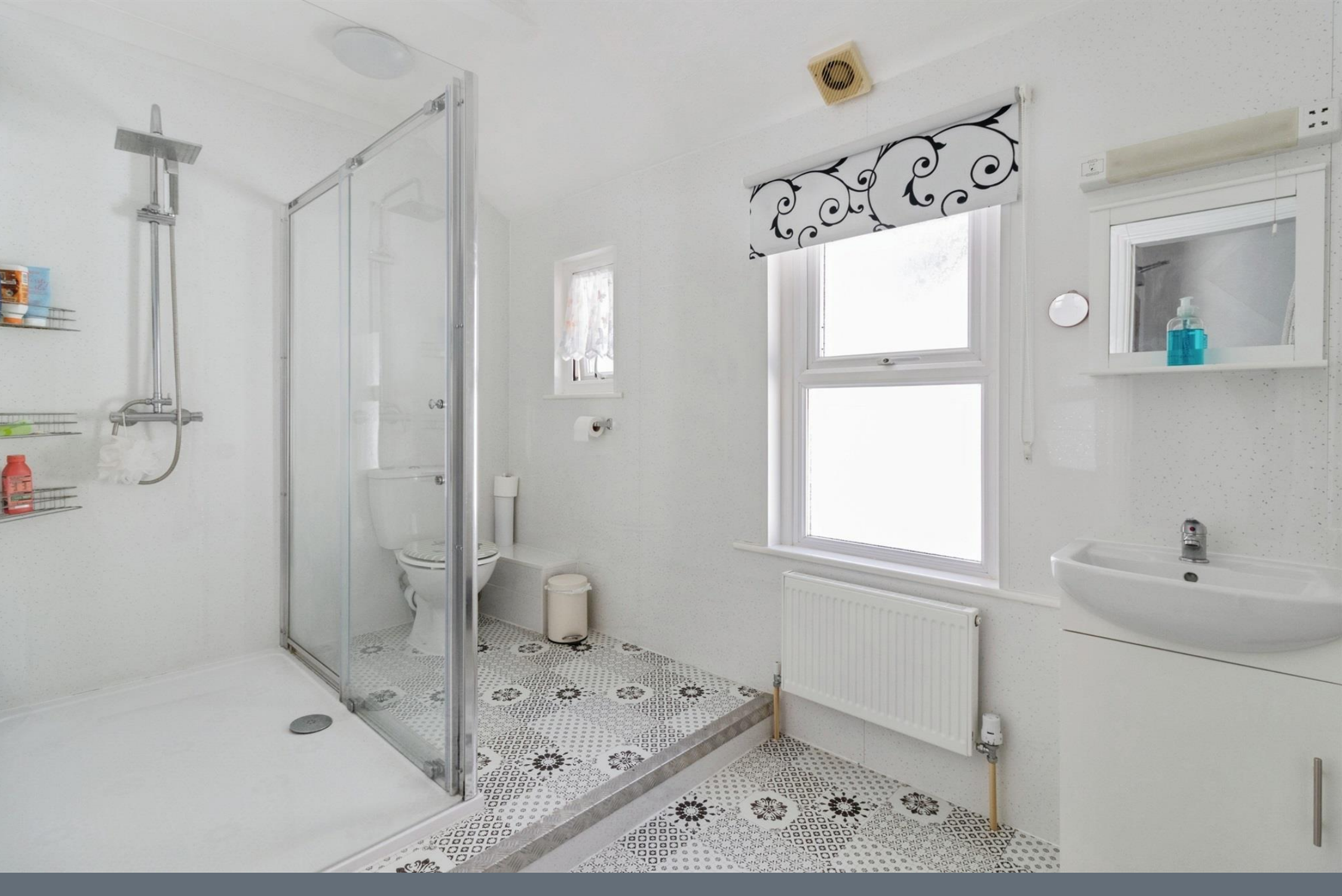
Residential Sales & Lettings | Mortgage Services | Conveyancing | Surveyors | Land & New Homes