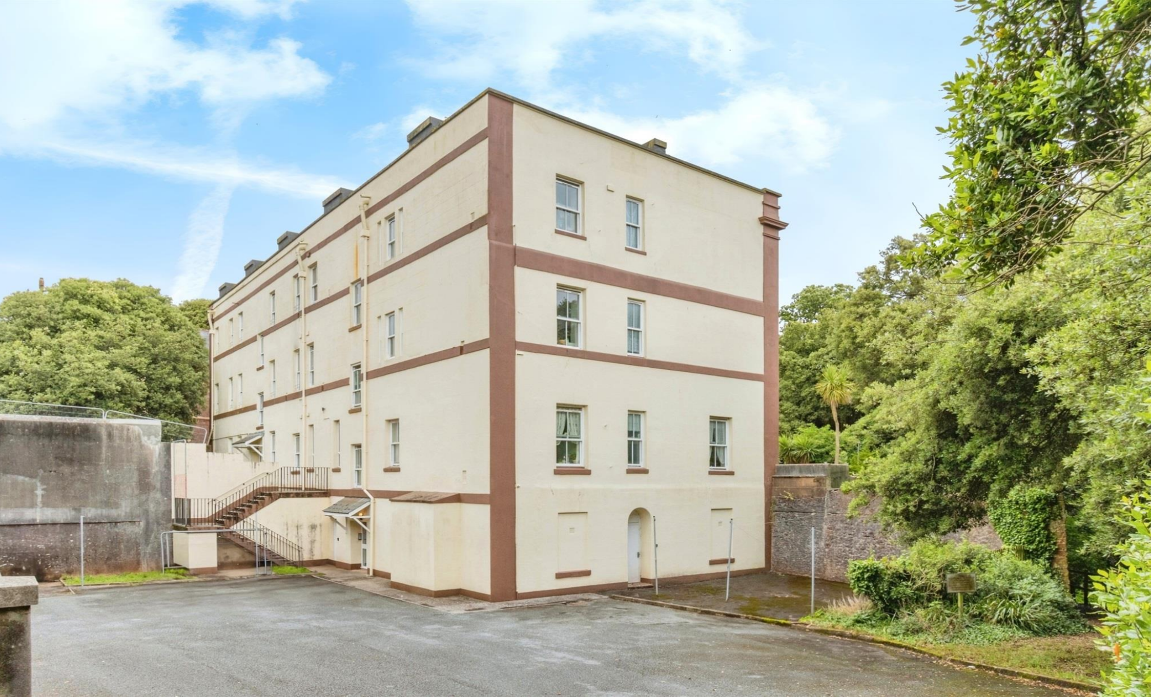
St Marys Court Berry Drive Paignton