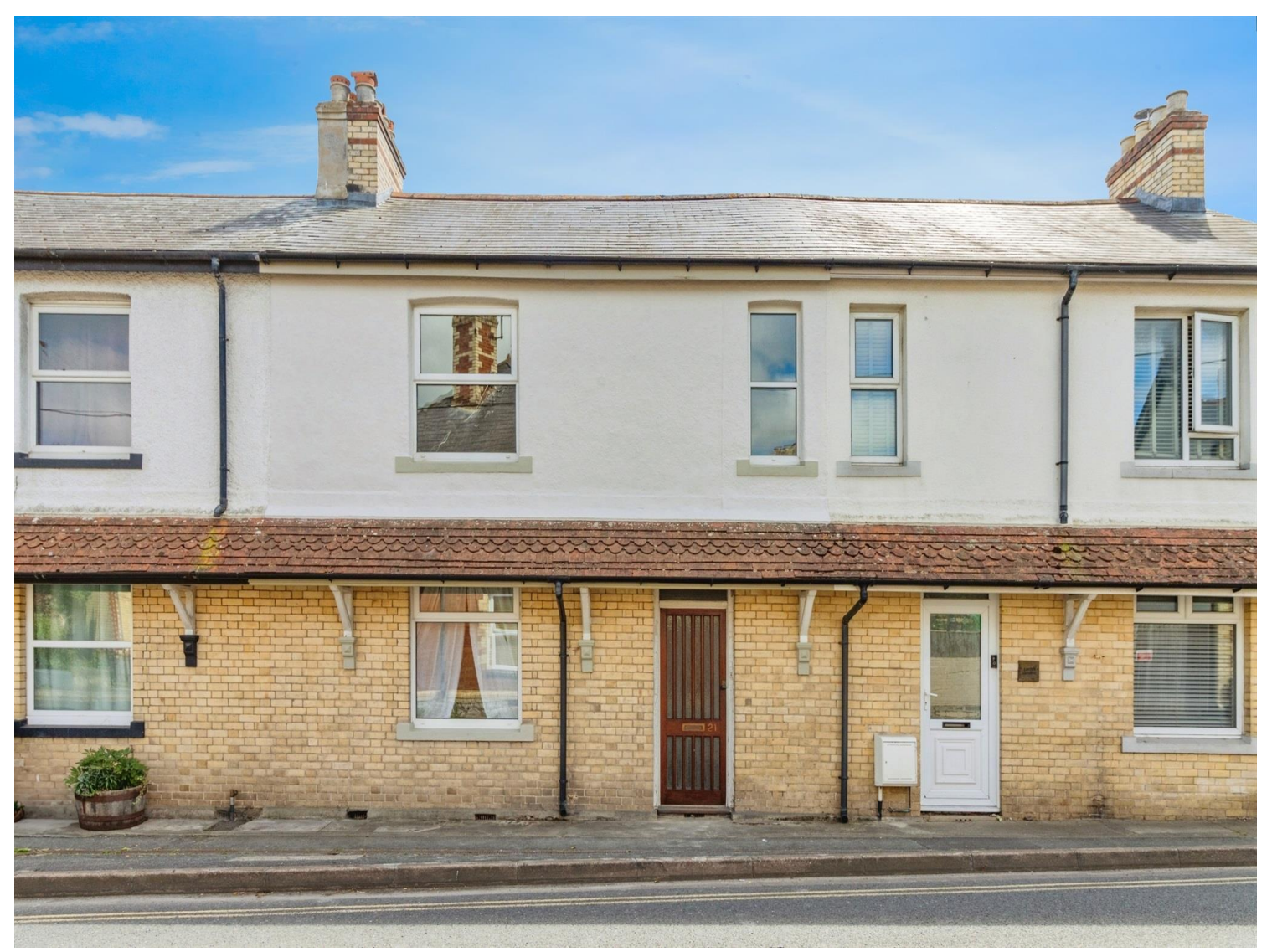
Oakford Kingsteignton Newton Abbot TQ12 3EQ

CHAIN FREE two bedroom + loft room currently under conversion to third bedroom, mid-terrace house which is currently in the process of being fully renovated.