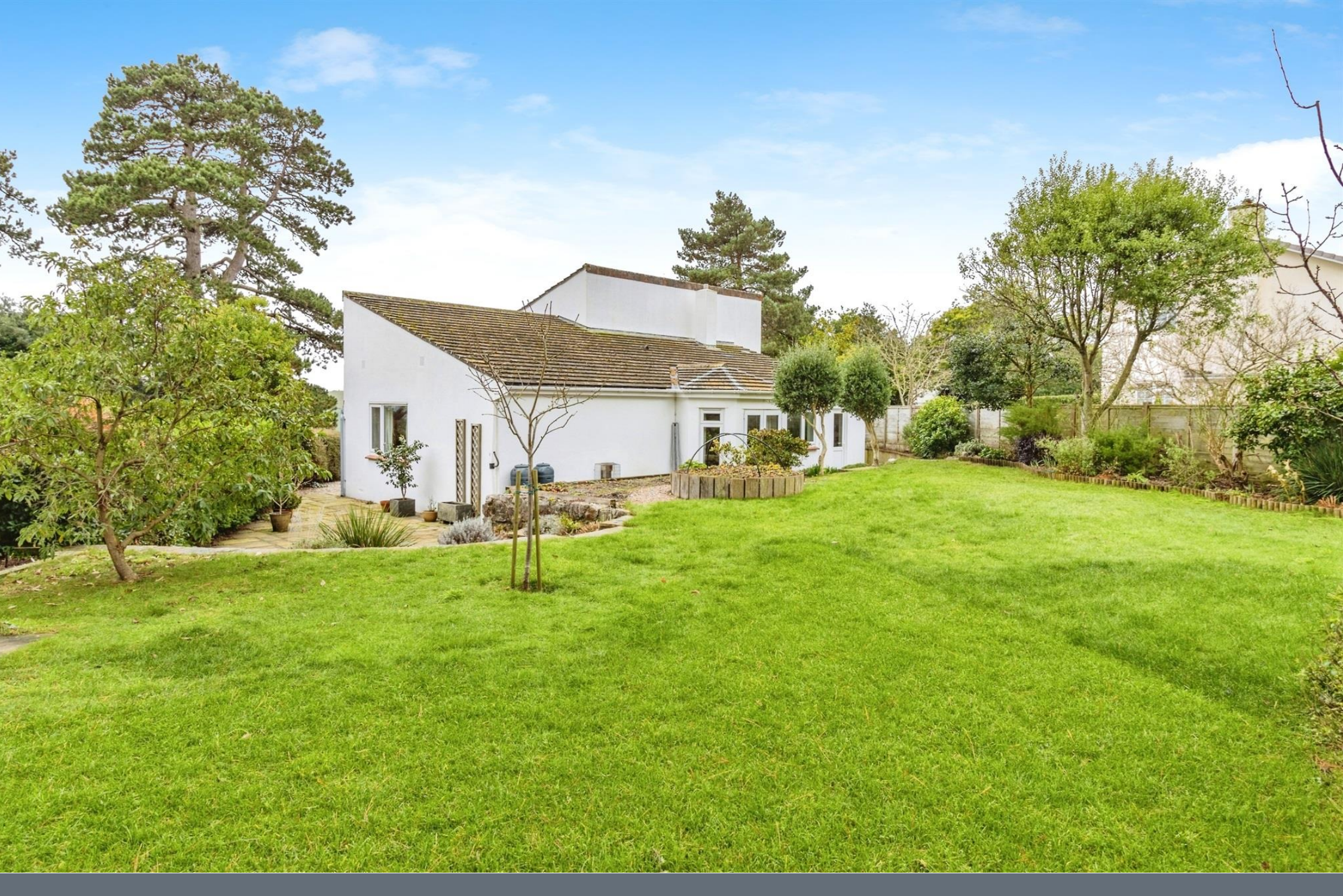
Residential Sales & Lettings | Mortgage Services | Conveyancing | Surveyors | Land & New Homes