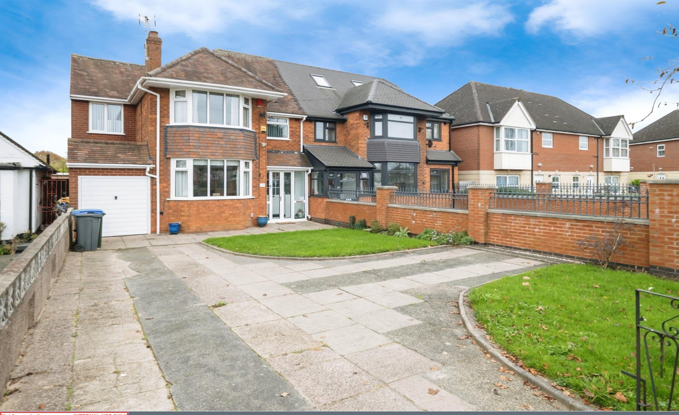
Not for marketing purposes INTERNAL USE ONLY