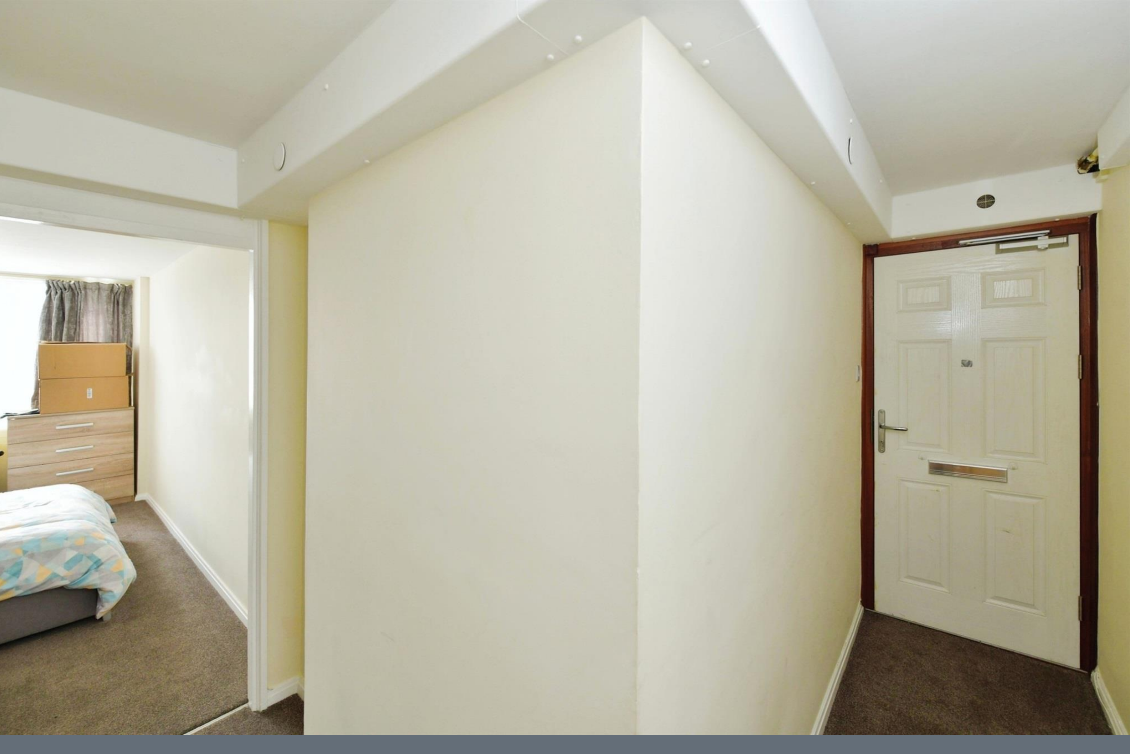
Residential Sales & Lettings | Mortgage Services | Conveyancing | Surveyors | Land & New Homes