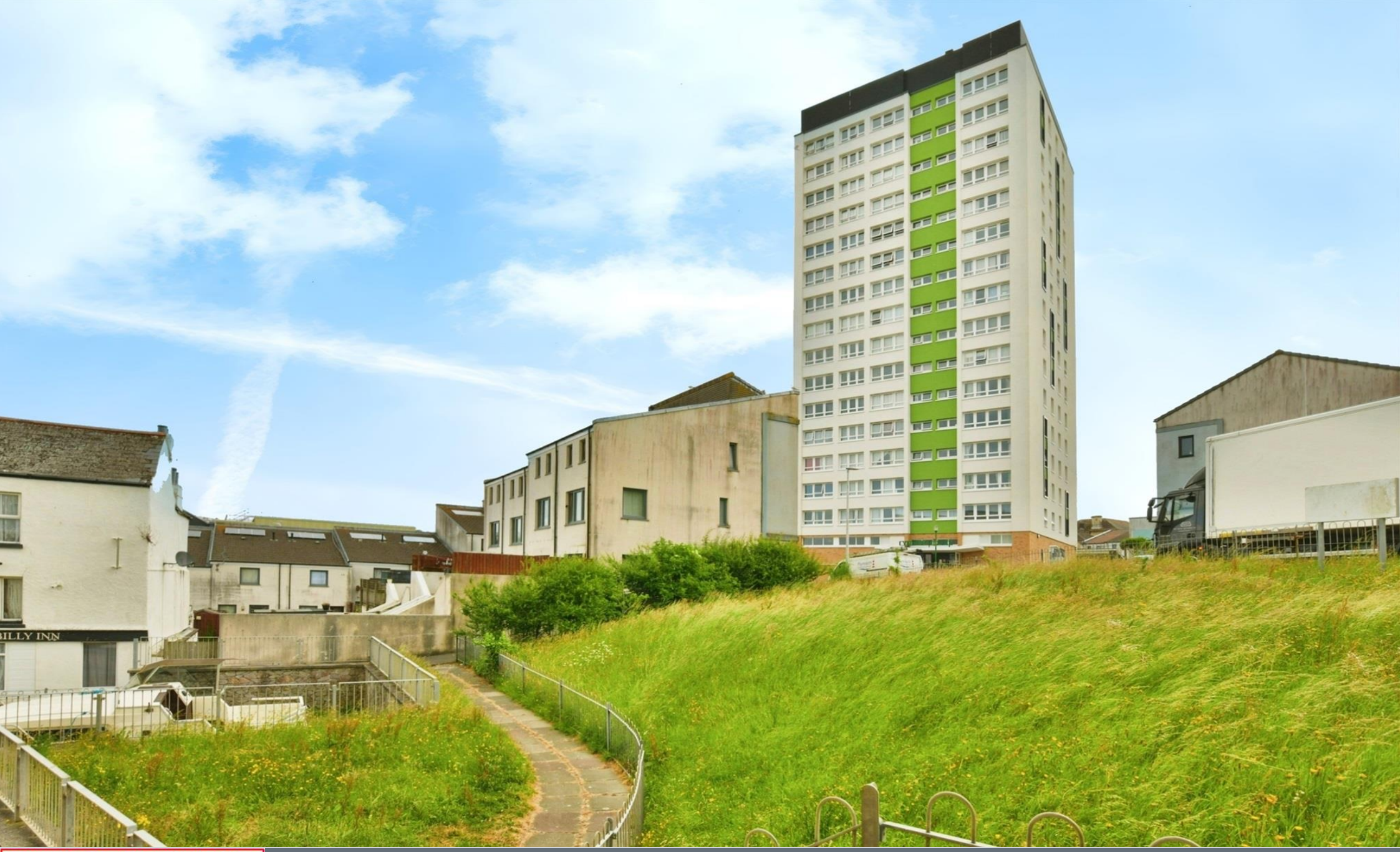
Not for marketing purposes INTERNAL USE ONLY