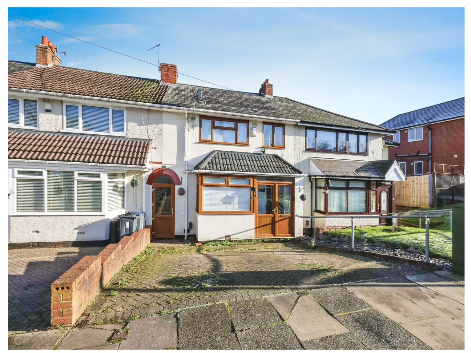
Henlow Road BIRMINGHAM B14 5DY