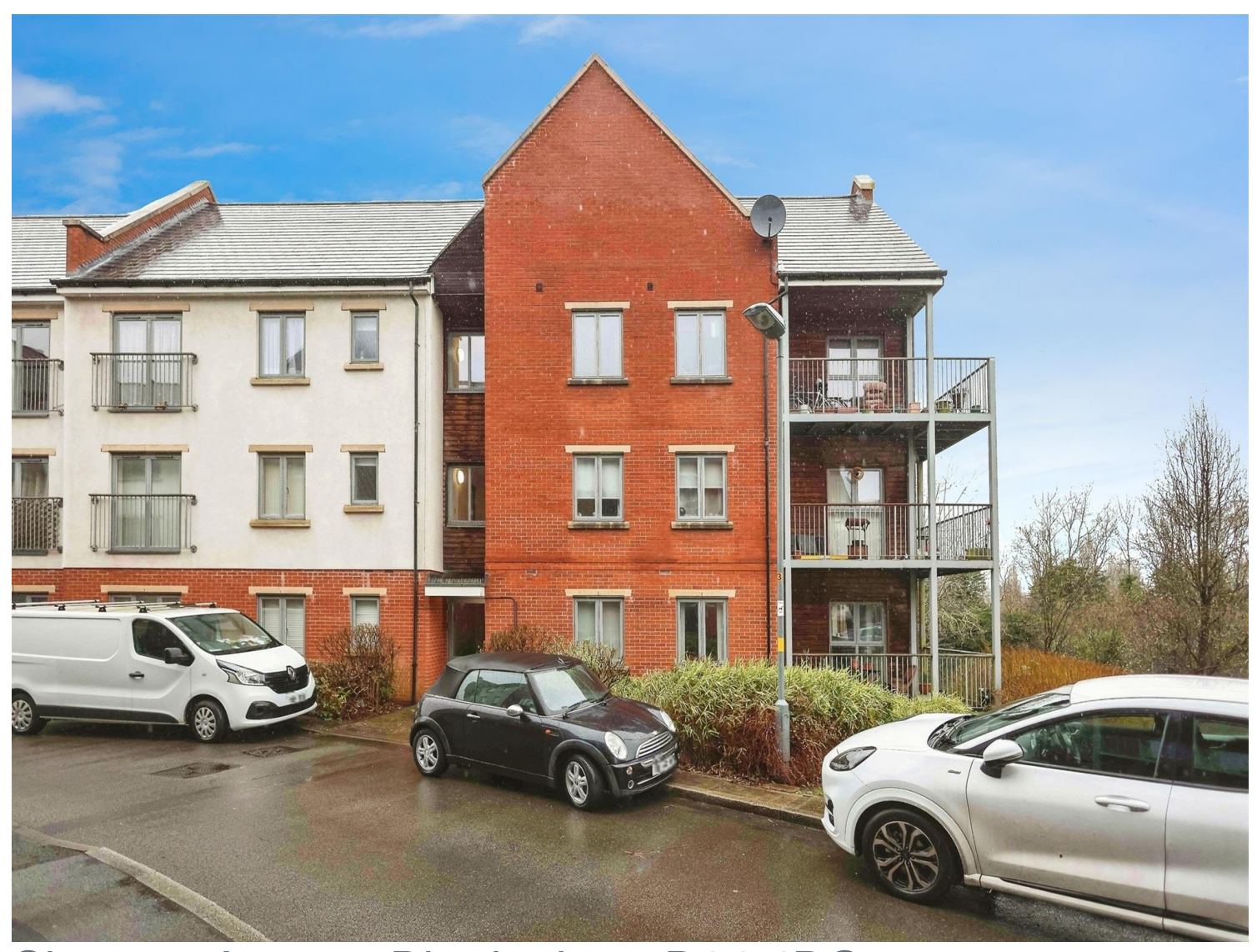
Shorters Avenue Birmingham B14 4BG

Ground Floor Apartment, Open Plan Lounge/Kitchen, Two bedrooms, Bathroom Plus En-Suite and Allocated Parking