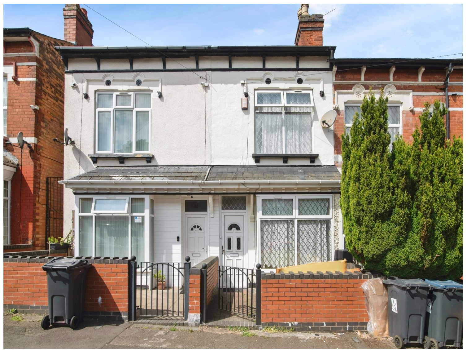
Brixham Road Birmingham B16 0JY