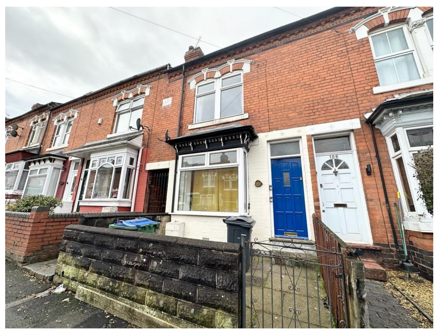
Katherine Road Smethwick B67 5RF

Take a look at this modern, fantastically located property on Katherine Road.