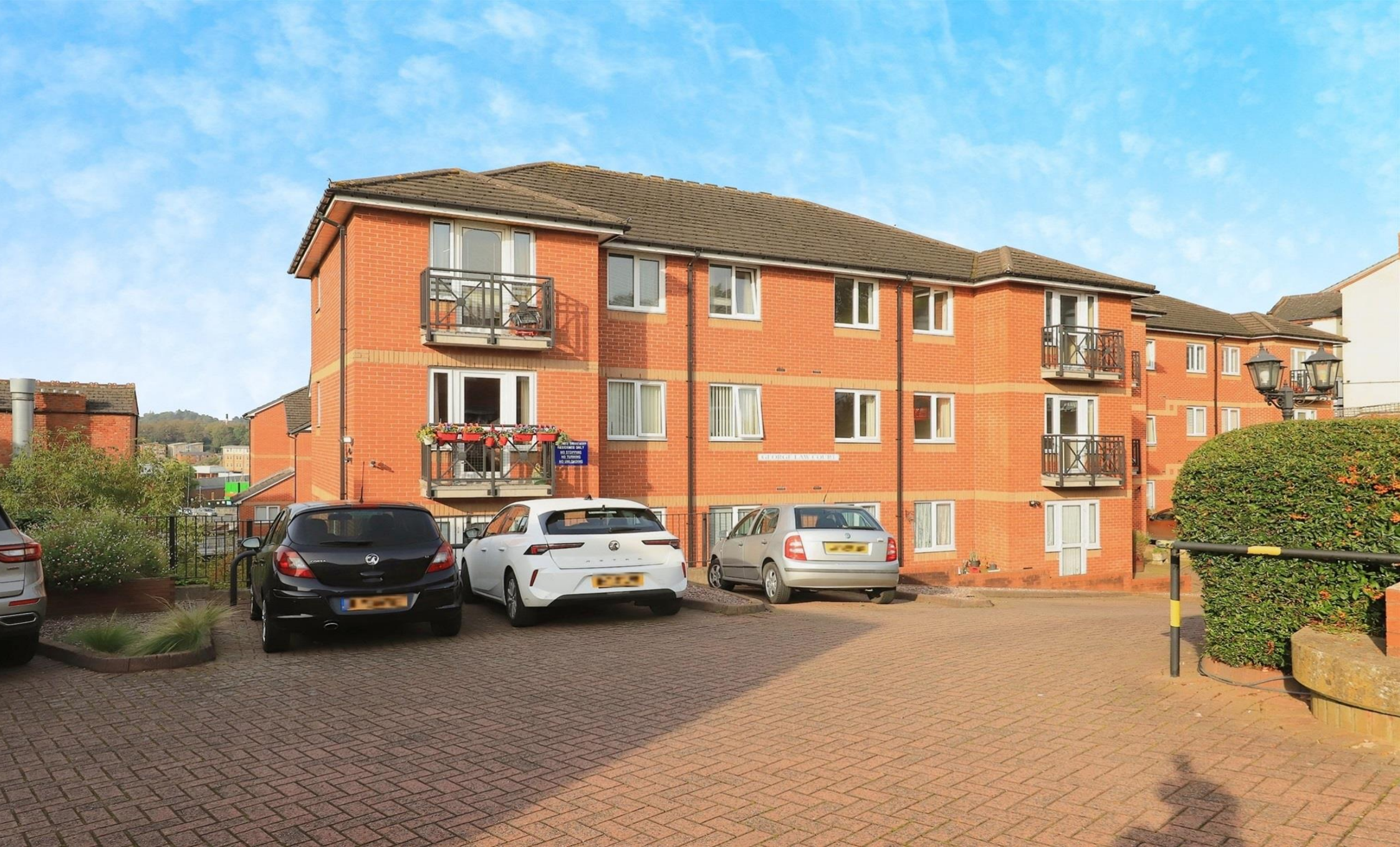
George Law Court Anchorfields Kidderminster