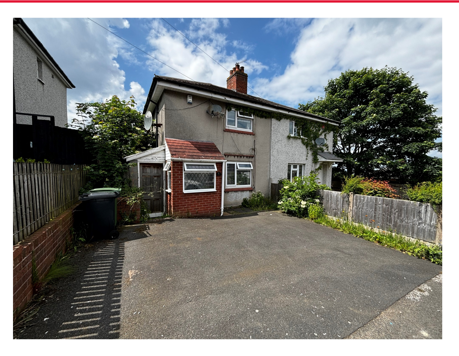
Tansley Hill Avenue Dudley DY2 7NG

**A TWO BEDROOM SEMI DETACHED HOME LOCATED IN A POPULAR RESIDENTIAL AREA AND CONVENIENTLY PLACED FOR LOCAL AMENITIES**PERFECT FOR FIRST TIME BUYERS OR INVESTORS**