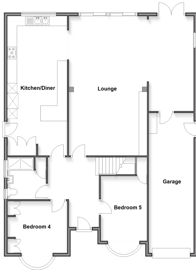
Ground Floor Approx. 158.8 sq. metres (1709.5 sq. feet)