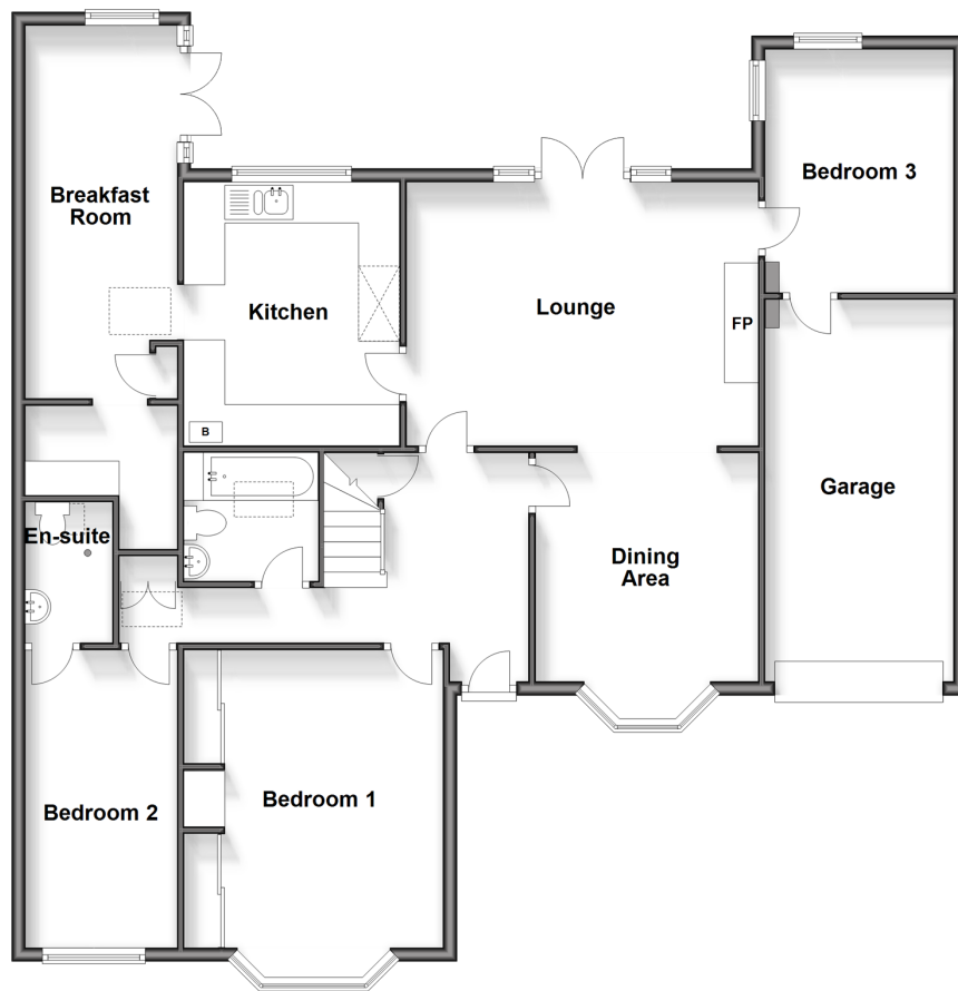
Ground Floor Approx. 133.7 sq. metres (1439.6 sq. feet)