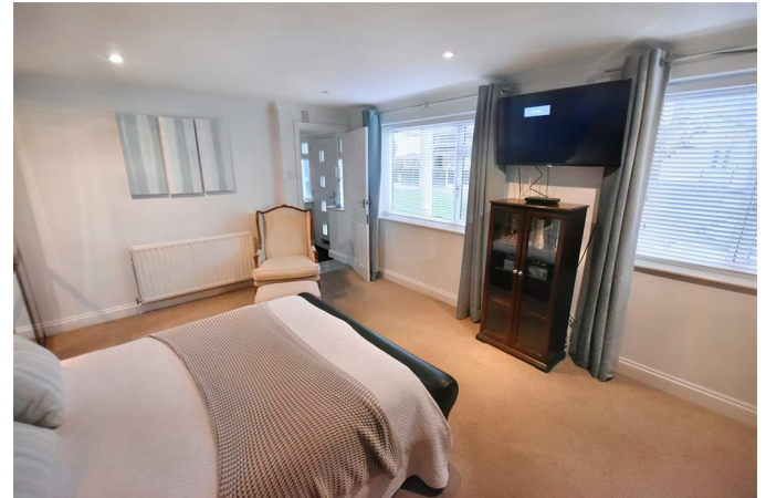
Bedroom One 18'1x13' (5.51mx3.96m)

A very spacious main bedroom, two double glazed windows to the front elevation, radiator. An extensive range of fitted wardrobes with an opening through to the en-suite bathroom.