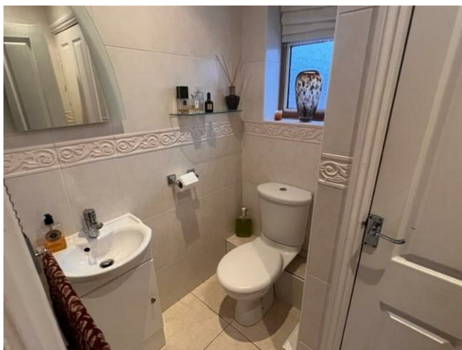
Cloakroom ( First Floor )

Window to the rear elevation, tiling to the walls and floor in ceramics, low-level w/c with push flush and vanity unit with inset wash hand basin, cupboard housing the modern fitted gas combination boiler