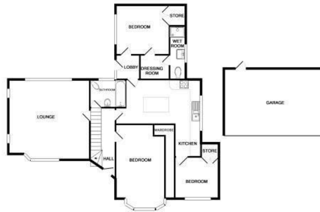
GROUND FLOOR APPROX. FLOOR AREA 1313 SQ.FT. (122.3 SQ.M.)