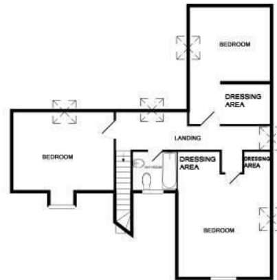
1ST FLOOR APPROX. FLOOR AREA 799 SQ.FT. (73.9 SQ.M.)

While every attempt has been made to ensure the accuracy of the floor plan contained herein, Stonebridge is not responsible for errors, omissions, or other matters that appear hereon and no responsibility is taken for any errors, omissions, or misstatements. This plan is for guide only and should be used as such by any prospective purchaser. The purchaser's attention is drawn to the fact that the plan is not a guarantee as to their size, ability or efficiency and no guarantee is made with respect thereto.