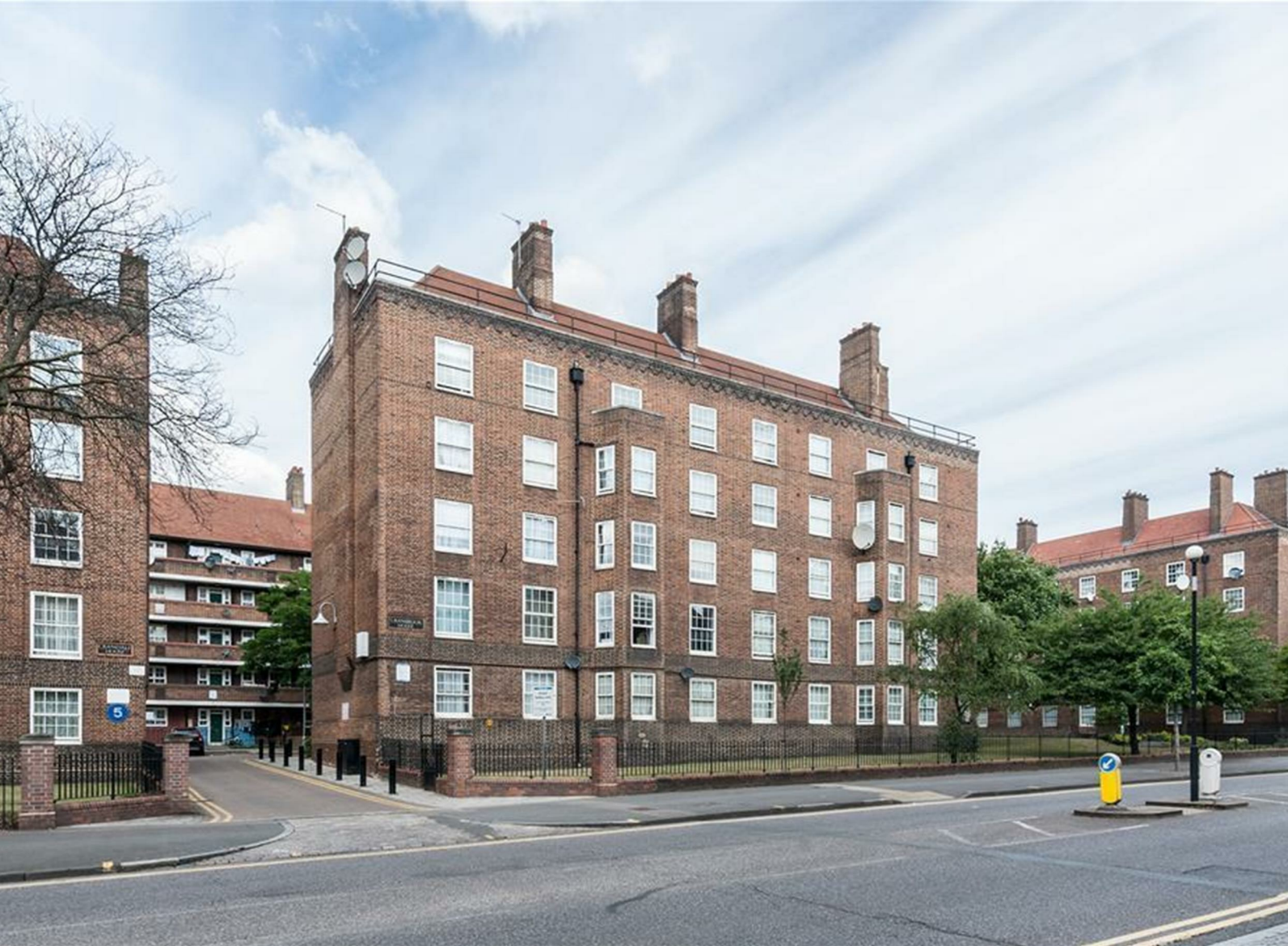
Pembury Road, London, E5