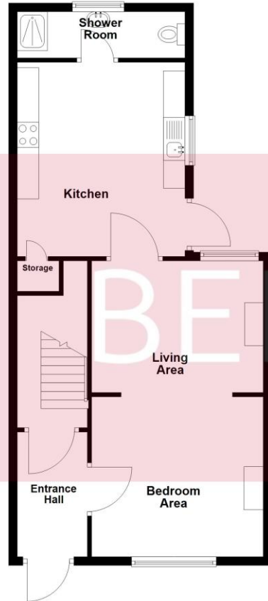
Ground Floor Apartment