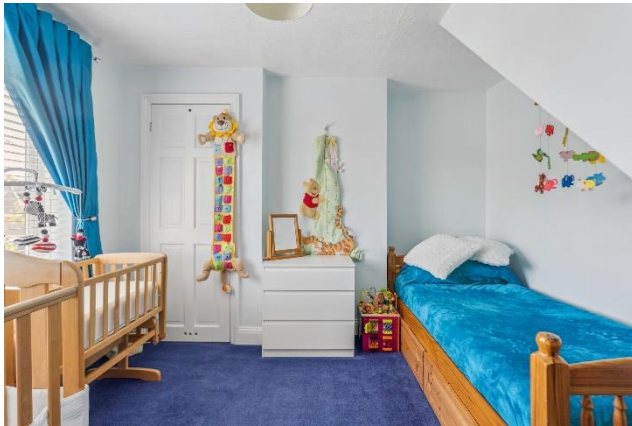
BEDROOM FOUR a front aspect room with built in cupboard.

BATHROOM with part tiled suite of panelled bath with wall mounted shower over & screen, wash hand basin with cupboards below, low level wc.