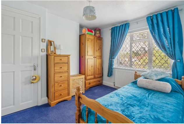
BEDROOM THREE a rear aspect room with built in cupboard.