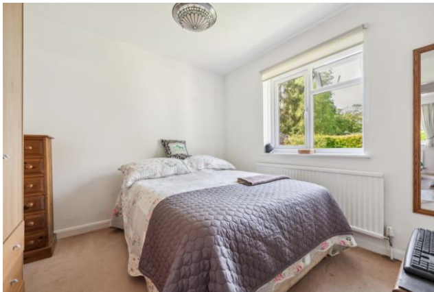
BEDROOM TWO double glazed window to rear, radiator.

TO THE REAR is a level garden, partly laid to lawn and partly paved with mature borders and beds, timber framed shed with power and light, greenhouse, wall and timber fence surround with access to both sides.