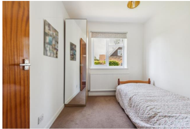
BEDROOM THREE double glazed window to rear, radiator.