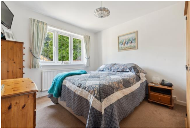
BEDROOM ONE double glazed window to front, radiator, television aerial point.