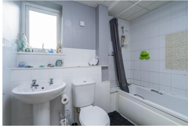
BATHROOM white suite comprising bath with electric shower over, wash hand basin, low level w.c., Amtico floor, radiator, spot lights, double glazed frosted window.