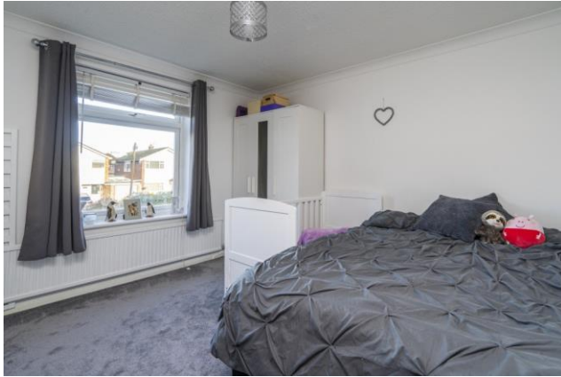
BEDROOM ONE with double glazed window, radiator.