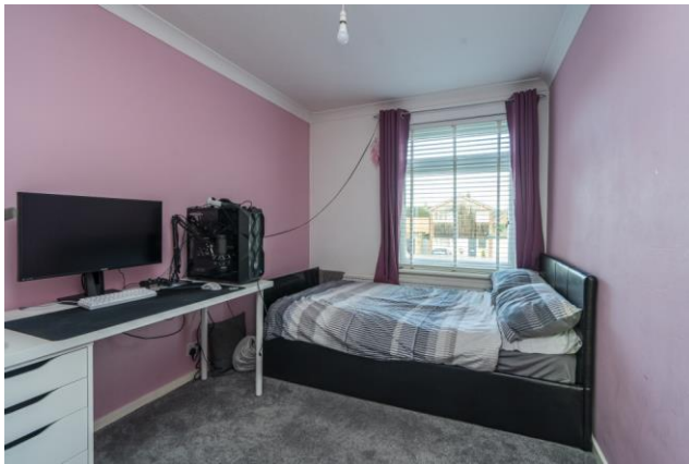
BEDROOM TWO with double glazed window, radiator.