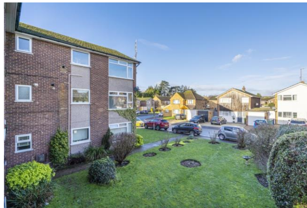
Surrounding Russell House are well kept lawned COMMUNAL GARDENS.

TENURE: Share of Freehold. SERVICE CHARGE: £429.60 per half year. LEASE REMAINING: 999 years from 1967.