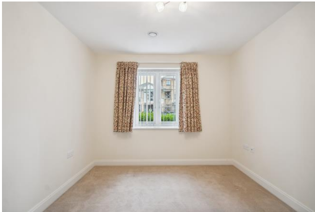
BEDROOM TWO front aspect room with double glazed window.