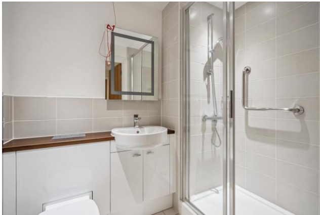
SHOWER ROOM modern white suite comprising fully enclosed shower cubicle with wall mounted shower unit and tiled surround, low level w.c. with enclosed cistern, ceramic hand wash basin with storage under, heated towel rail, part tiled walls and tiled floor.