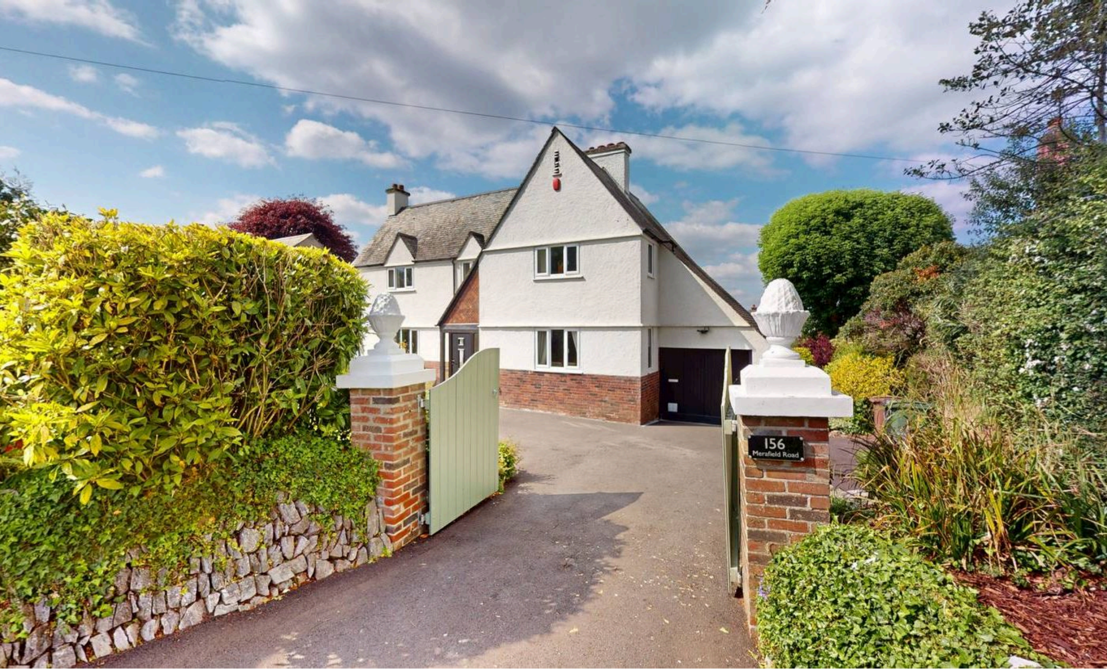
Merafield Road, Plympton, Plymouth PL7 1SJ £575,000 Freehold