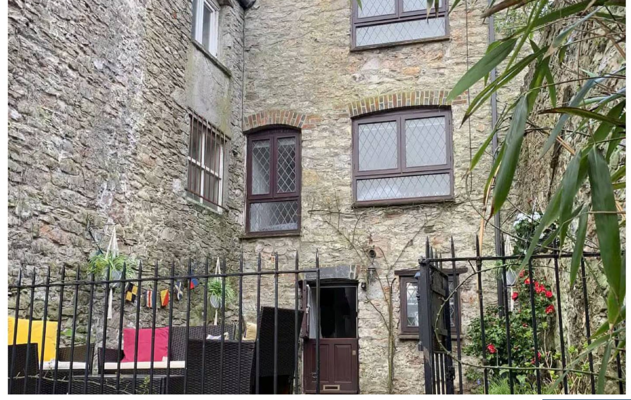
Fisherman's Cottage, New Street, The Barbican, Plymouth, PL1 2NB £215,000 FREEHOLD